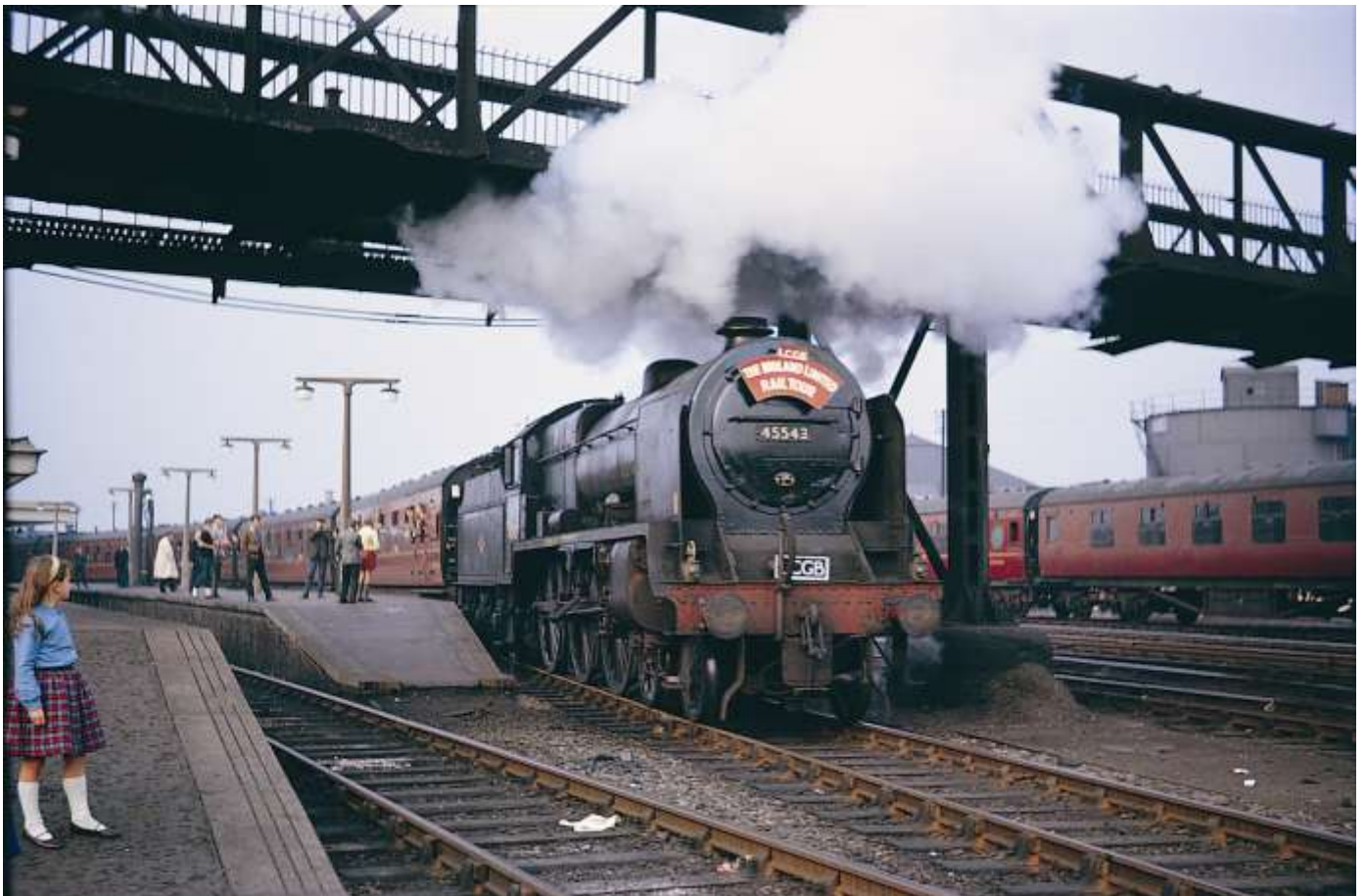
45543 'HOME GUARD' is seen at Derby (Midland Station) on 14th October 1962 on an LCGB railtour 'The Midland Limited'. This tour started at London Marylebone and visited Nottingham Victoria. 45543 worked the leg from Derby to Northampton Bridge Street.

We will be having our Sales Stand on the platform at Llangollen during the Gala, and all Members are invited to come and support the Project and the Llangollen Railway at 'The Corwen Patriot Gala'. We hope to see you there.