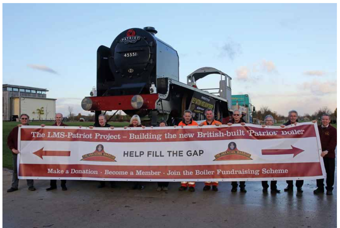
Members of The LMS-Patriot Project Team, and Allelys Heavy Haulage staff at The National Memorial Arboretum on 21st November.