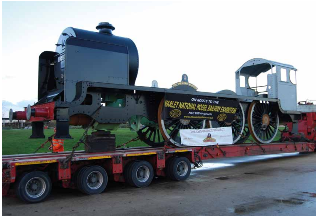
'The Unknown Warrior' is seen arriving at the National Memorial Arboretum.

Just after 3pm 'The Unknown Warrior' departed the NMA and was transported by Allelys to the NEC, Birmingham where it stayed overnight in the NEC car park before entering Hall 5 the next morning at 6am.