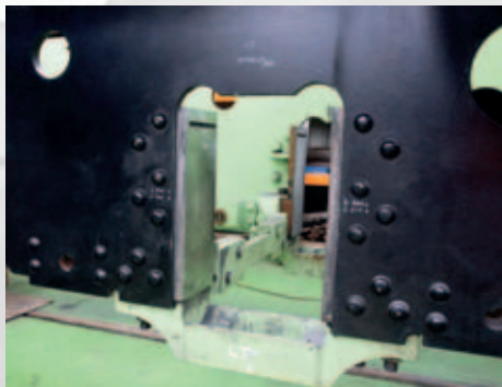
Horn guide grinding is being undertaken at Tyseley Loco Works.

A breakdown on the horn grinding rig has added more time to the task than originally planned, but this work is now expected to be complete by mid-March. Once the grinding is complete the frame assembly will be measured to give exact axle centres and the offsets established to finally machine the axle boxes to fit. The lead for the balance weights is on order, about \frac{3}{4} ton of it! The weights are being filled using Tyseley's 'Jubilee' 5593 'Kolhapur' as a guide, as we do not have full information for a 'Patriot' and all the rotation machinery on a 'Jubilee' is the same as the 'Patriot'.