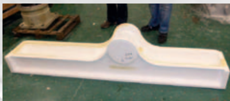
Polystyrene pattern for motion girder.

The CAD model for the outside cylinders was completed in early February and delivered to the pattern makers. Work to make these is expected to be completed in early