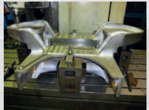
Bogie Centre Casting.