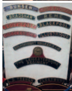
Original 'Patriot' nameplates loaned for the Warley Exhibition at the NEC, November 2013.