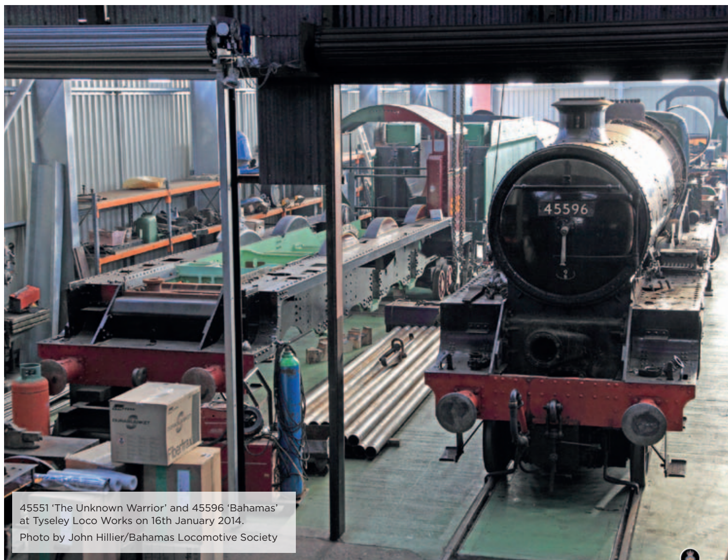
45551 'The Unknown Warrior' and 45596 'Bahamas' at Tyseley Loco Works on 16th January 2014.

'The Unknown Warrior' was taken to Tyseley directly after the Warley National Model Railway Exhibition on 25th November to have its axle boxes fitted, as temporary wooden ones had been used at Llangollen to enable the driving wheels to be fitted for the National Memorial Arboretum and Warley visits. While 'Bahamas' has been taken to Tyseley for a major general overhaul, arriving on the evening of the 27th November 2013.