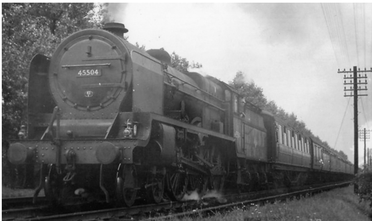
45504 'Royal Signals' is seen at Blackwell on the Lickey incline on 27 th July 1960.