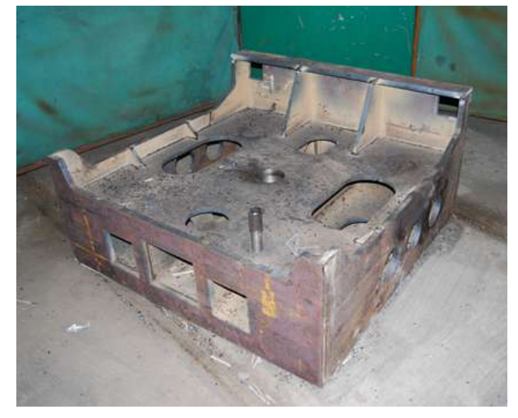
The newly constructed dragbox is seen at the Llangollen Railway Works during December 2009, before being sent away for heat treatment.

Further progress has now been made obtaining drawings, with the discovery of the entire collection of drawings produced by the North British Locomotive Company of Glasgow for the 'Royal Scot' class, in the Glasgow University Archive. The drawing lists for the Royal Scot, 'Patriot and Jubilee classes have also been obtained from the NRM at York. These will allow us to compare the drawings produced for the three classes to establish which of these were common between the three classes. If parts are found to be common between the 'Scot' and 'Patriot' we can obtain copies of the original drawings that were produced by the NBL. If drawings cannot be found for the 'Patriot' components