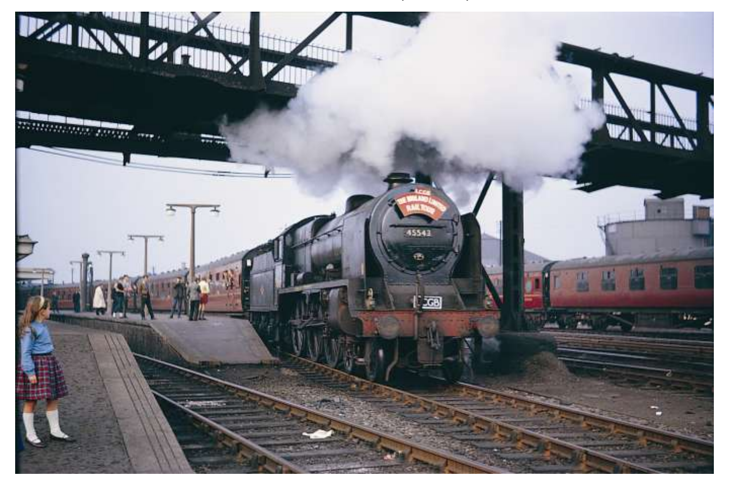
45543 'HOME GUARD' is seen at Derby (Midland Station) on 14th October 1962 on an LCGB railtour 'The Midland Limited'. This tour started at London Marylebone and visited Nottingham Victoria. 45543 worked the leg from Derby to Northampton Bridge Street.

We are in discussion with the Railway about running a Members Train during the 'The Corwen Patriot Gala', and a photo charter is being planned around the time of the Gala hopefully using the visiting engine. 30 places will be available for the photo charter, which will cost £30 each. If you are interested in buying a place on the photo charter, please contact us. We will be having our Sales Stand on the platform at Llangollen during the Gala, and all Members are invited to come and support the Project and the Llangollen Railway at 'The Corwen Patriot Gala'. We hope to see you there.