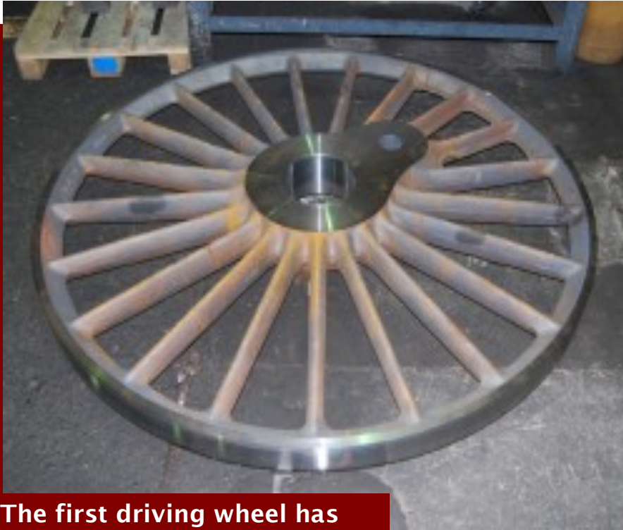
The first driving wheel has now been machined

The drawings for the running plate, splashers and drop ends will be completed shortly and these will be fitted to the frames by mid-year. We hope to be able to have two wheelsets complete by the end of July. The remaining one, with crank axle will await further fundraising.