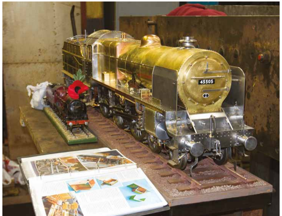
Member Alan Crossfeld brought his superb 5" gauge of 45505 'The Royal Army Ordnance Corps' for display during Members' Day.