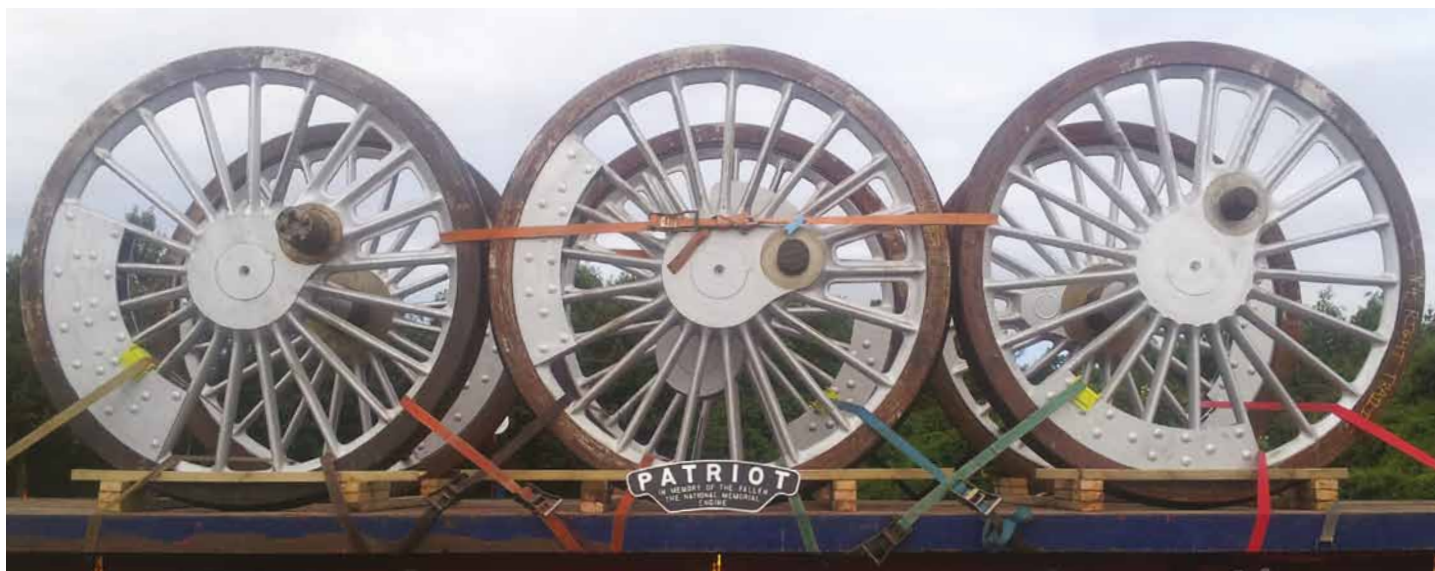
Driving wheelsets seen at Strensham Services on the M5 en route to Tyseley Loco Works on 3rd July.