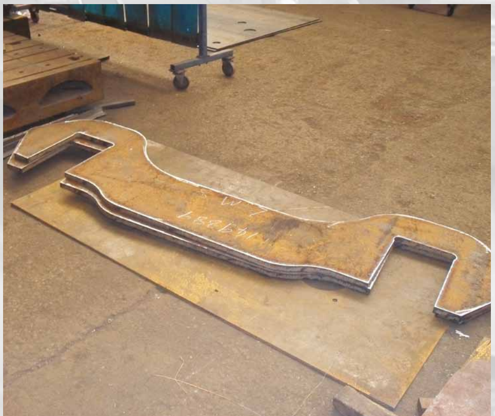
The newly cut bogie frame plates at Morgans UK Ltd, Tyseley.