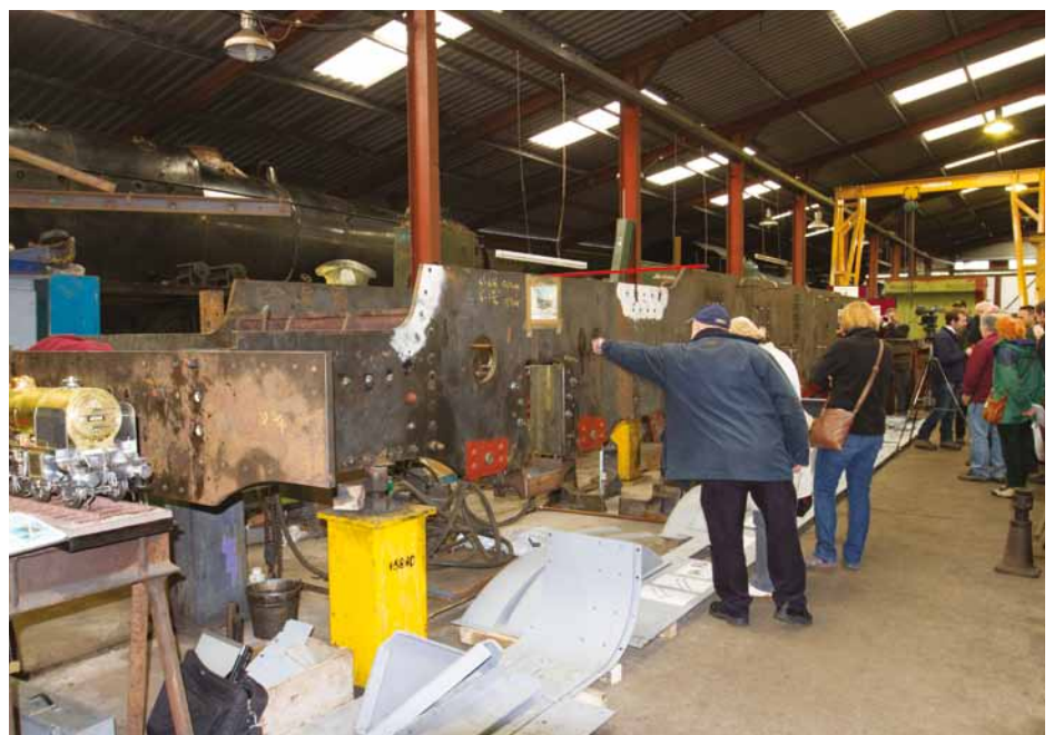
Members viewing progress with the frames assembly inside the Llangollen Railway Works.