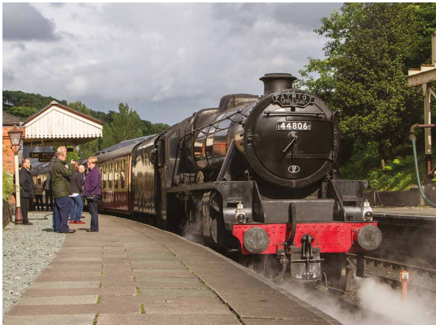
Stanier 'Black 5' No. 44806 is seen at Llangollen station with the specially produced PATRIOT headboard which it carried during Members' Day.