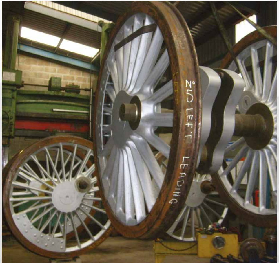
Completed driving wheelsets at SDR on 2nd July,