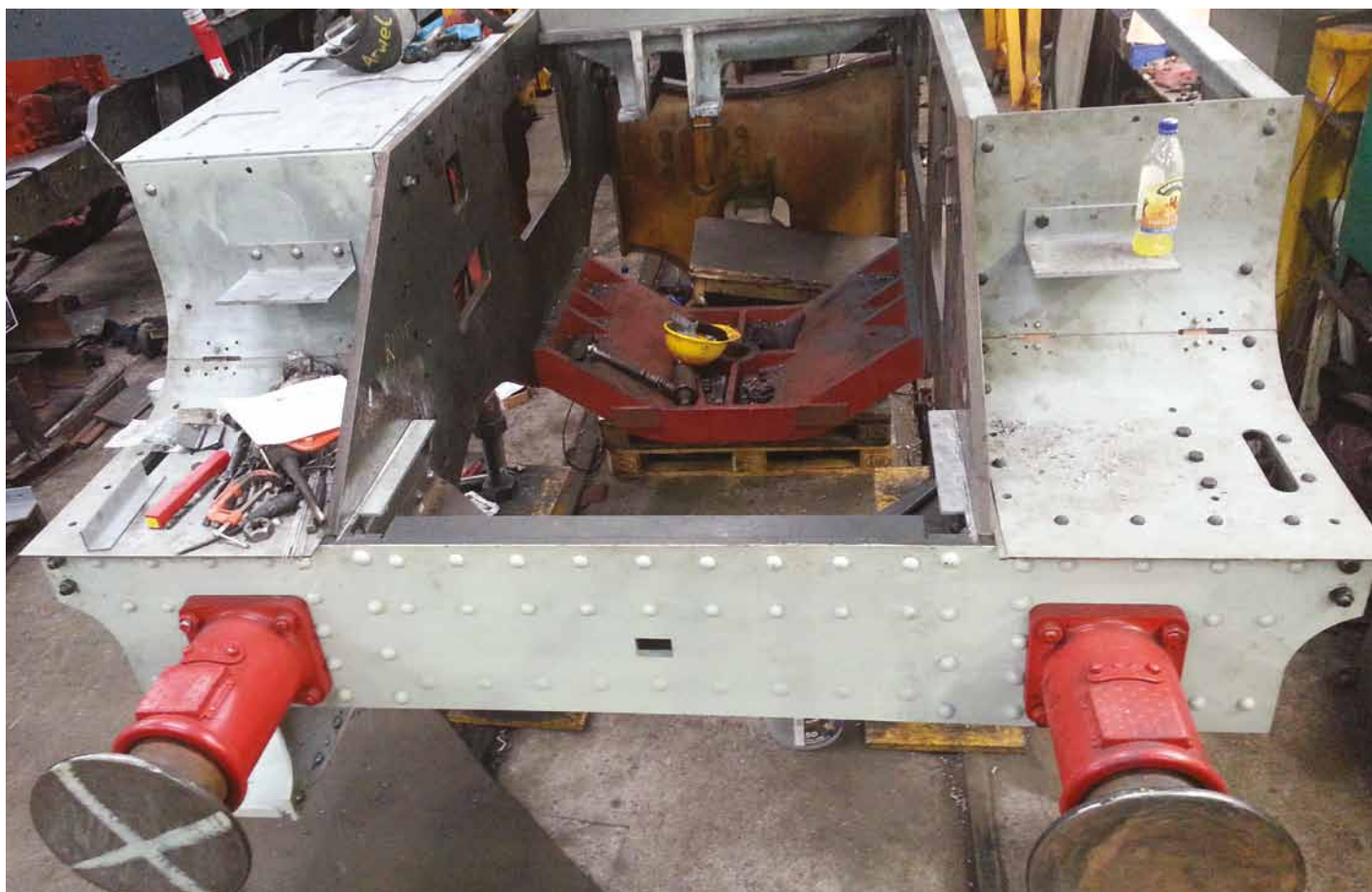
The front end of 'The Unknown Warrior' is seen at the Llangollen Railway Works on 24th July.