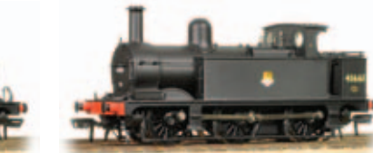
31-431 Midland Class 1F BR Black Early Emblem 41661