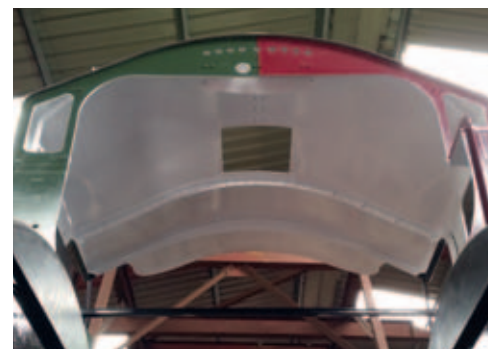
▲ The inside of the cab looks pristine thanks to the hard work of the painting gang.

The tender parts currently at Llangollen have been accessed for refurbishment and painting. We have recently made an agreement for the tender to be refurbished completely by a company in Alfreton, as reported on page 24. The tender parts are now expected to move in late September.