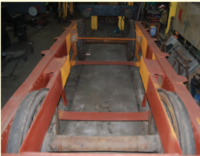
▲ The stripped down tender frames are seen at Llangollen during April 2013 prior to refurbishment at Rowlescourt Engineering.

Further information about Rowlescourt Engineering Ltd. can be found at www.rowlescourt.co.uk