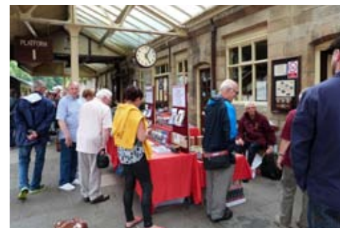
▲ The ever-present sales stand attracts plenty of interest.

Thank you to everyone who attended this year to make it a success.