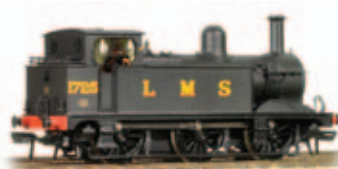
31-430 Midland Class 1F LMS Black 1725