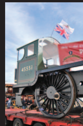
The Union and Patriot Project flags fly high above the cab of 'The Unknown Warrior' at the Great Dorset Steam Fair.