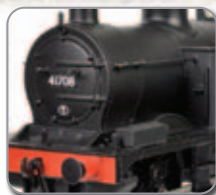
31-432 Midland Class 1F BR Black Late Crest Running No. 41708