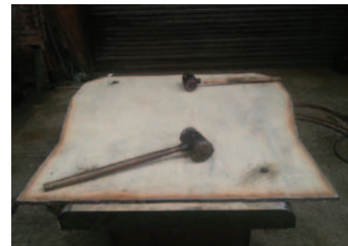
▲ Copper sheet about to be formed as the first section of the firebox is made at LNWR Heritage, Crewe in June this year.