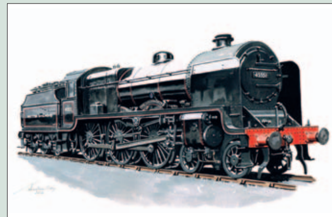
The Unknown Warrior in BR Black by Jonathan Clay

You can order any of these prints by visiting our web shop at www.lms-patriot.org.uk or by calling 01785 244156